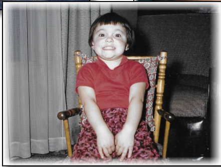
Services In Care Of White-Reynolds Funeral Chapel